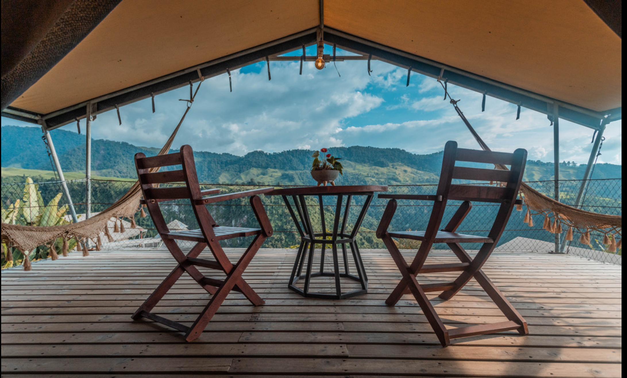
Condors terrace as the entrance terrace this front deck has a dining table and pair of hammocks so you can contemplate the landscape or wait until the condors appear.