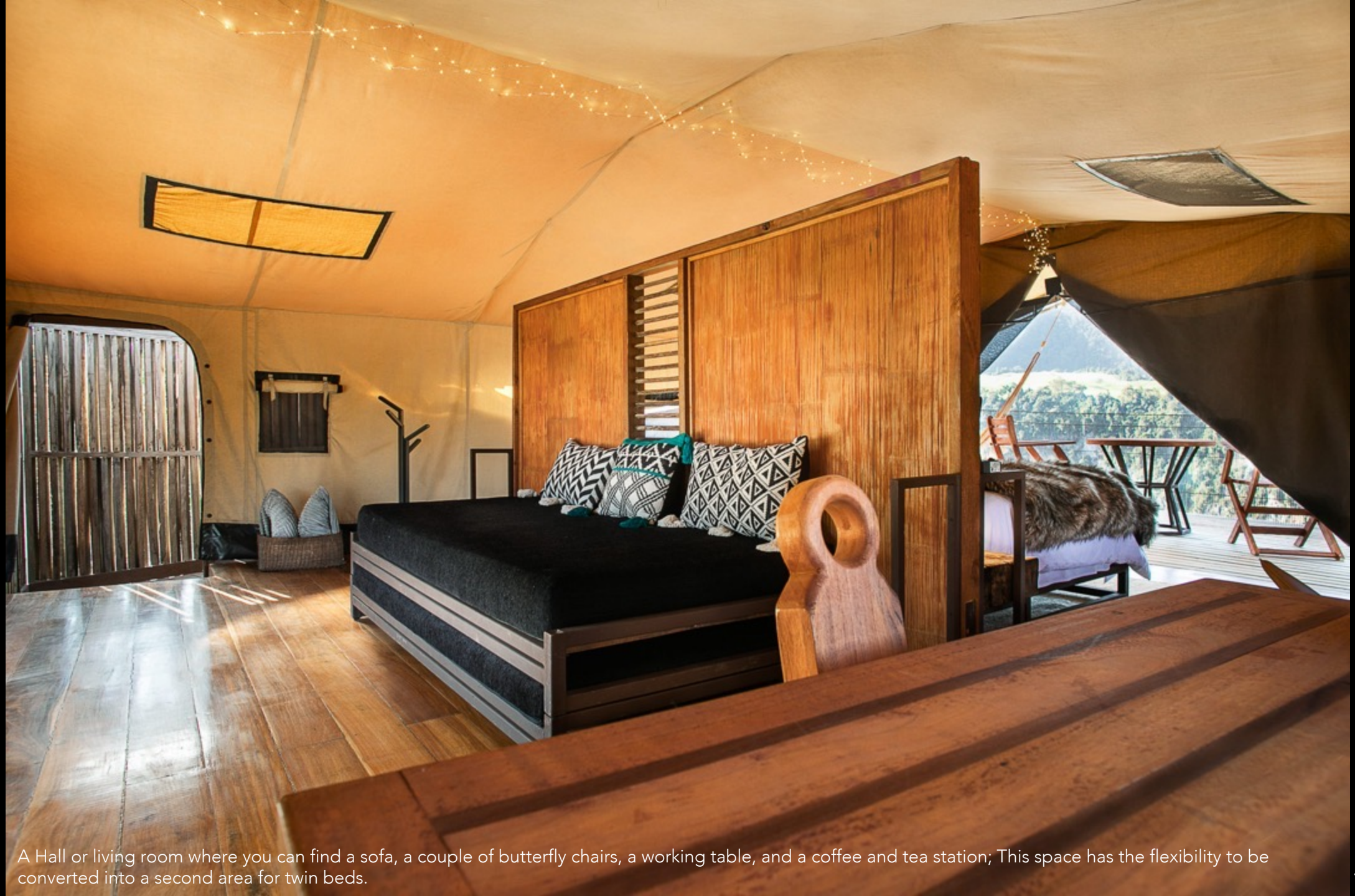
A Hall or living room where you can find a sofa, a couple of butterfly chairs, a working table, and a coffee and tea station; This space has the flexibility to be converted into a second area for twin beds.