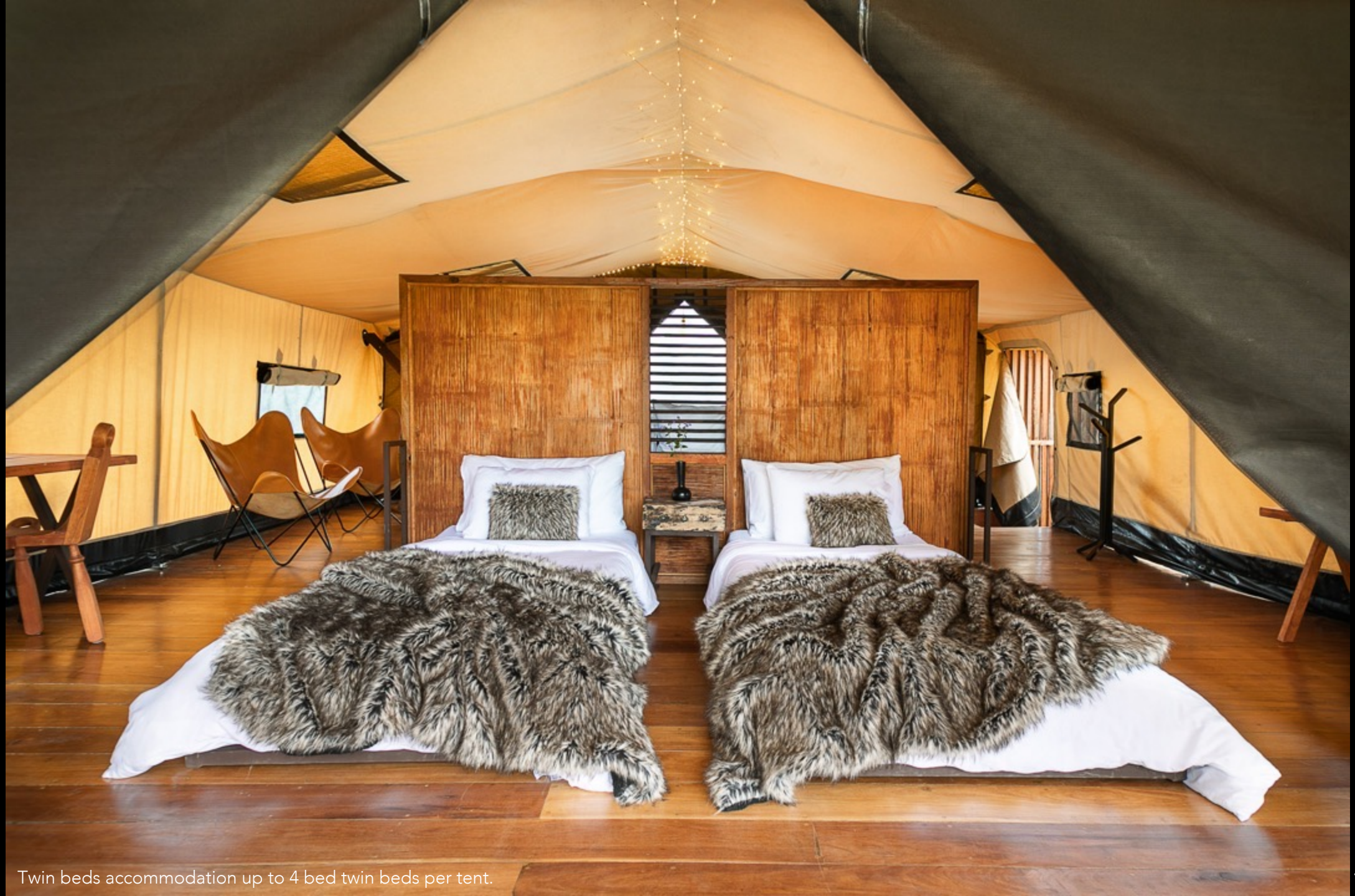
Twin beds accommodation up to 4 bed twin beds per tent.